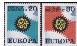
May 2, 1967