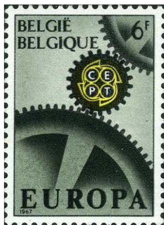
December 1967 "Cogwheels"

Europa issues Nineteen countries, which included Andorra, Belgium, Cyprus, France, Germany, Greece, Ireland, Iceland, Italy, Liechtenstein, Monaco,