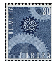
March 13, 1967