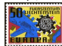
April 20, 1967